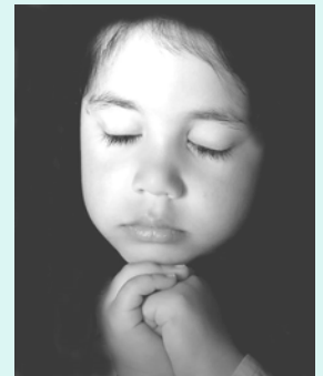
How has this year been to you?

How has this year been to you? What are your joys, happiness and moments of deep love for God and the people who mean much to you in your life? Ponder too on the trials and pains that pepper these significant moments. Pray for the graces of peace and hope of the Advent season.