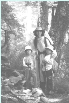
How's your present life?

How is your present life? Pause . . . ponder . . . sense . . . affirm the presence of God within you . . . in all that is happening daily . . .